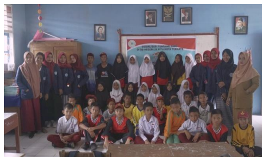
Fig. 4. Photo with Team, Students and Teachers

To find out the level of knowledge the Extension Team provides sheets (Pre-Tets and Post-Test), it can be seen in the table below: