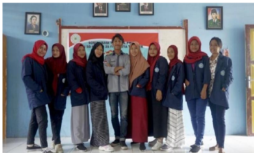
Fig. 3. Counseling Team