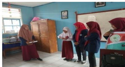
Fig. 2. PHBS simulation