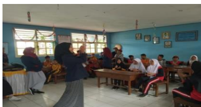
Fig.1 Delivery of PHBS Materials

Before the extension material was delivered to students, the ibM team distributed pretest sheets about PHBS to test students' knowledge, and after doing counseling, the ibM team re-tested students' knowledge about PHBS by distributing posttest sheets to students with a total of 10 questions. The documentation of outreach activities is described in the following figure: