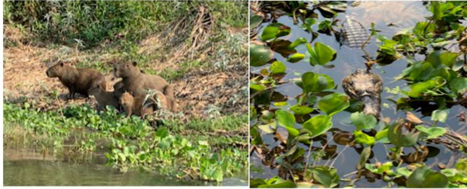
Fig 4. Pantanal, with its unique flora and fauna.

US$ 750.00. A few families earn higher than three minimum wages. Unexpectedly, some families with monthly wages higher than the minimum wage are taking the opportunity to send their kids to join the project. There is no cost to Judo activities anyway. Furthermore, some kids are joining the project to get school tutorial support and involvement with the arts during project activities. In addition, the small vegetable garden with chicken has become very popular too. Another interesting point to address here is that the Cáceres region is known for the world's largest freshwater swamp area, the Pantanal, with its unique flora and fauna. See Figure 4. Inside this beautiful region, with dramatic local contrasts and challenges, the Gonçalves project is running.