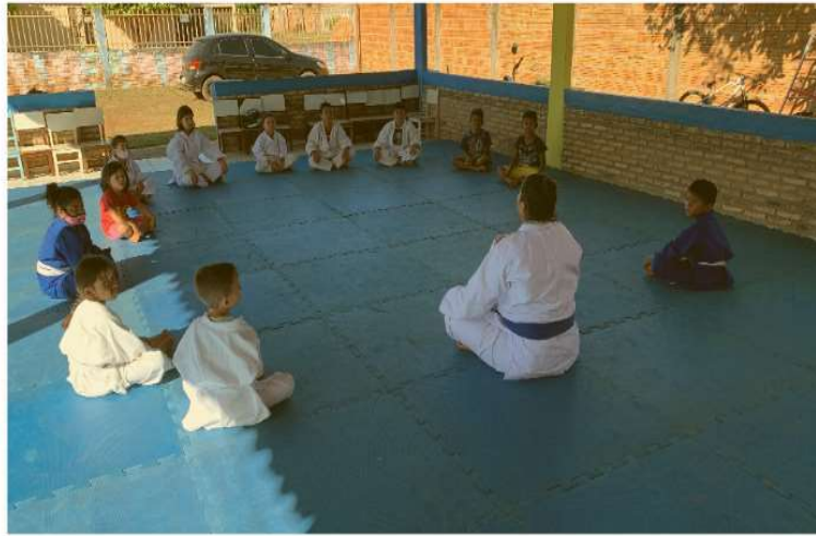
Fig 2. Children in their Judo class. Offer of the project through local voluntary work.

which is a tremendous success for such a project with so many difficulties it has already faced. The main project targets are to enroll kids between 6 and 16 years old. See Figure 2 and Figure 3.