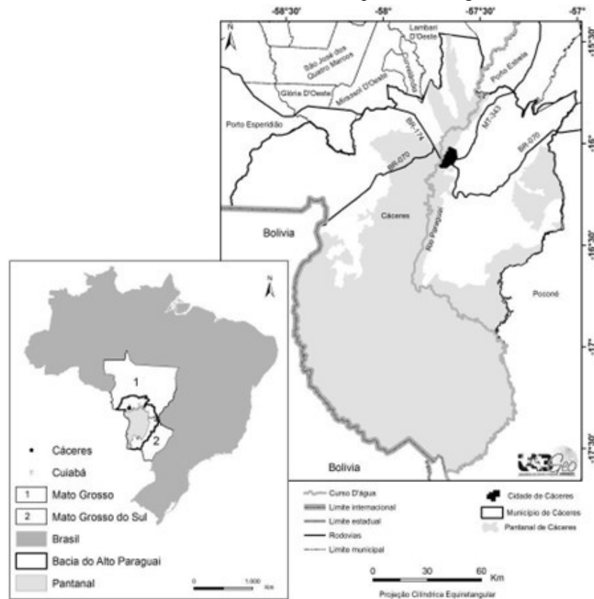
Fig 1. Cáceres in Mato Grosso, Brazil.

project is located outside the famous and well-known cities in Brazil, which have a particular historical background regarding the involvement of children with drugs and dealers. In principle, one of the main foundations of the project was to find a way to get children out of those risks and criminality. Cáceres is a small town in the central west of Brazil, in Mato Grosso. See the map below in Figure 1: