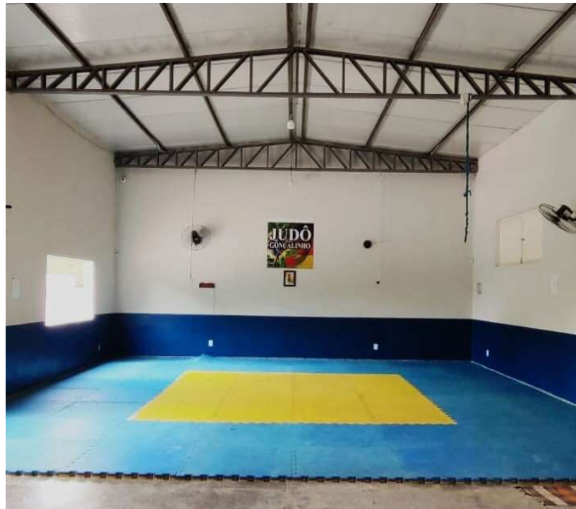
Fig 6. New fully renovated facility for future Judo and additional sports activities.