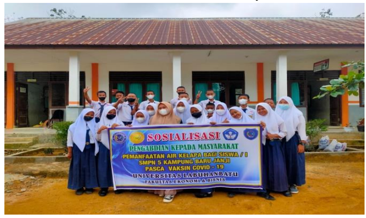
Fig 5. Together with the students of SMP Negeri 5 Blade Barat

Coconut water contains electrolytes, carbohydrates, fiber, protein, and vitamin C, calcium, magnesium, and potassium which are useful for supporting the body's fluid and electrolyte balance. Coconut water can also help with diarrhea, indigestion, constipation, worms, bladder infections. Meanwhile, vaccines contain compounds that can trigger the formation of antibodies to boost immunity.