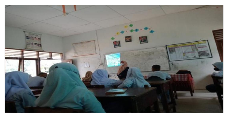
Fig 2. Understanding of the material