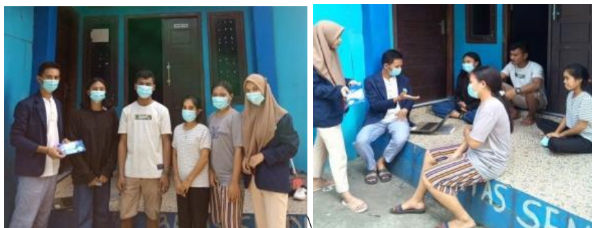
Fig 2. Situation of the socialization of the implementation of the 3M movement, followed by the distribution of masks at Kos Pury Nayla