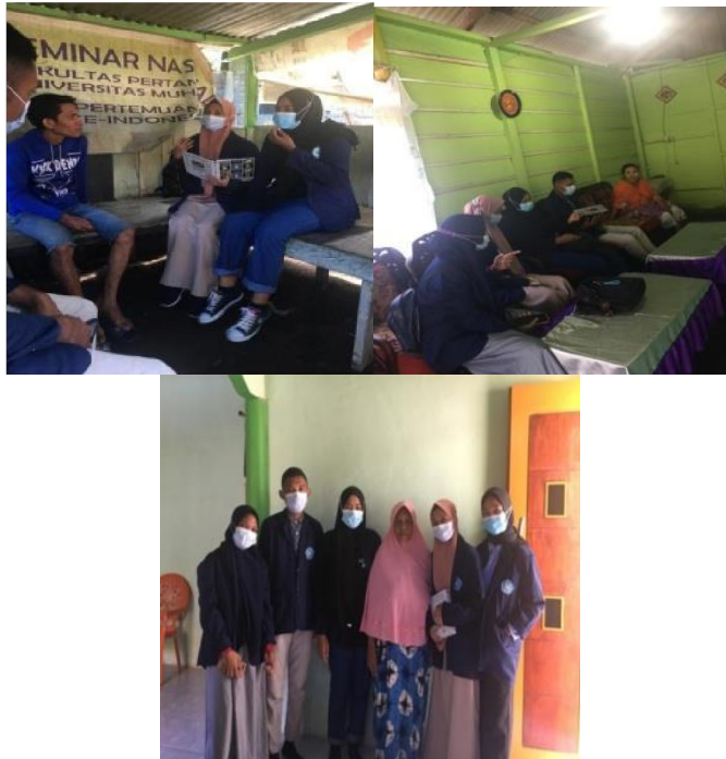
Fig 3. Situation of the socialization of the implementation of the 3M movement, followed by the distribution of posters in Kel. Sasa