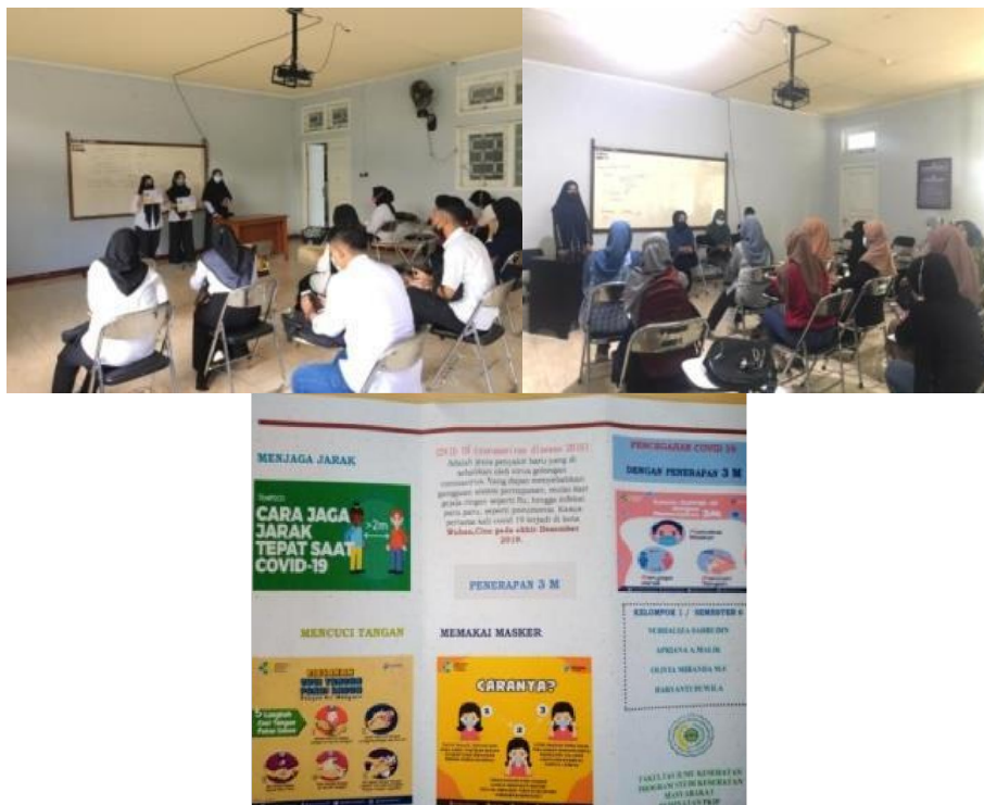
Fig 1. Situation of the Socialization of the Implementation of the 3M Movement in the UMMU Medical School Room