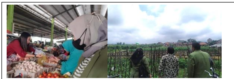
Fig 2. field sruvey in the Giripurno market in and tomato's agriculture land

The last step in this program is to convey the swot analysis results and deliver the recommendation to the village officer about the policy that should be taken to develop the village by the small enterprise, especially sweet-dried tomatoes.