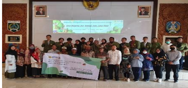
Fig 3. Workshop with Giripurno village community and Village officer

this strategy. WT Strategy is some strategy to minimize weakness and avoid the threat. Collaboration between the family welfare program, village-owned enterprises and the tomato farmer can be one example of this strategy. A farmer passionate about farming cannot easily learn how to make a product. Some housewives may need additional money for their expenses. The village officer can help create a local sweet-dried tomato small enterprise through a village-owned enterprise. the workshop as one strategy to motivate people as shown in figure 3.