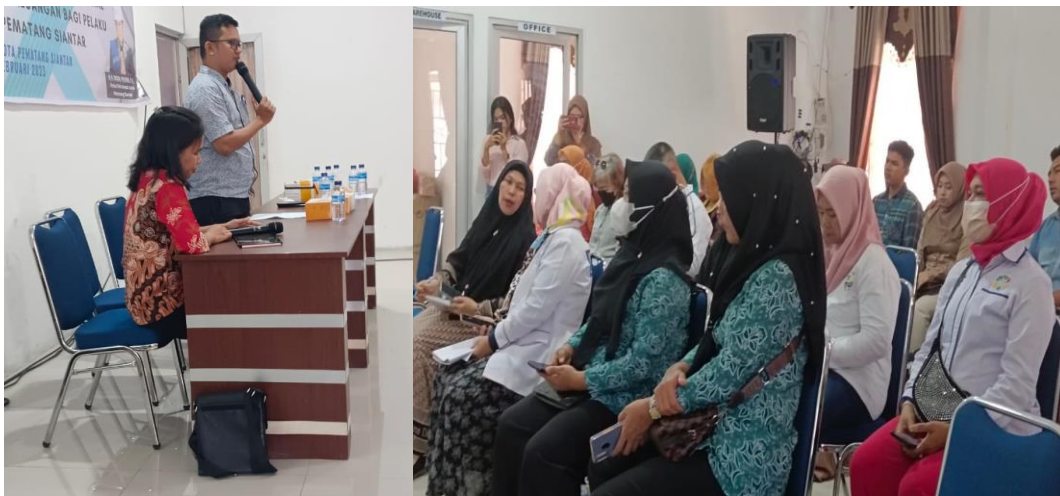
Fig 3. Presentation on the Importance of Preparing IKM/UMKM Financial Management

If the use of social media is carried out optimally by SMEs, of course this can increase the competitiveness of SMEs themselves. SMEs will find it easier to communicate through social media regarding prices, products, distribution, and promotions carried out (Siswanto, 2018).