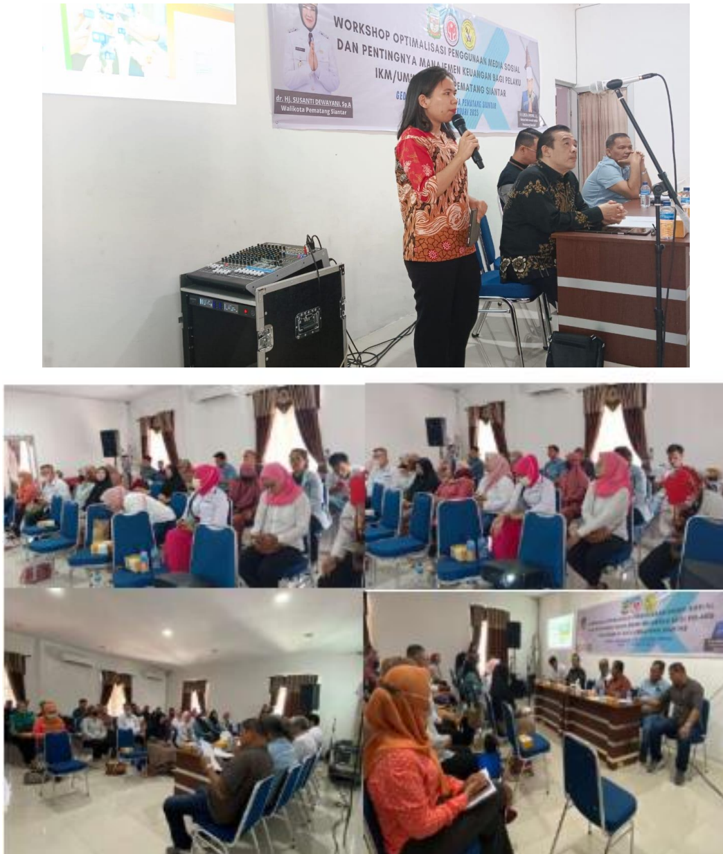
Fig 2. Submission of Material Benefits of Using Social Media in Small and Medium Enterprises