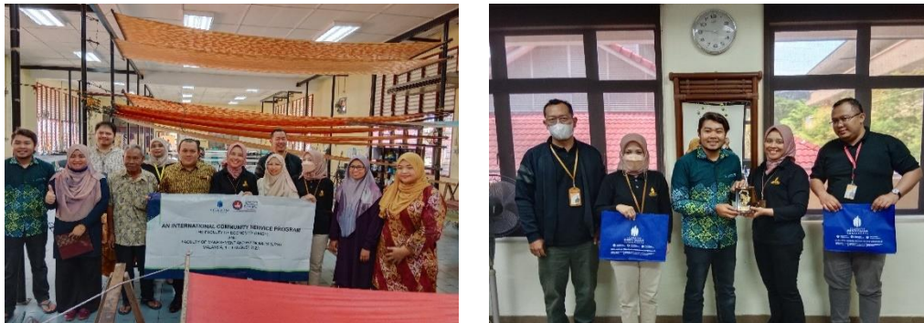
Fig 8. Photo with international community service participants