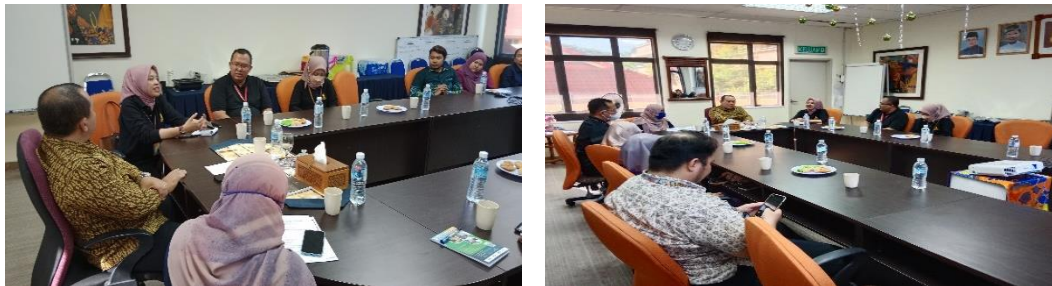
Fig 9. Sharing Session

Sharing session activities are carried out after counseling activities and after the international community service team visits partner production sites. In this activity an evaluation of the programs that have been carried out, especially the benefits obtained by partners and the input provided by partners to the community trust team in order to improve the quality of the programs being implemented. At the end of the activity, the international community service team gave certificates to all program participants.