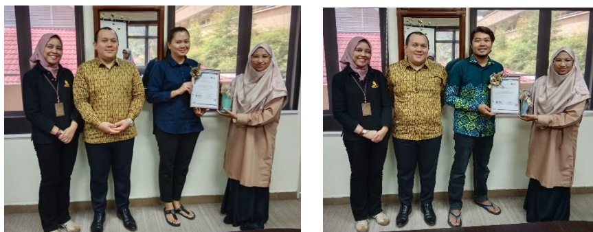
Fig 10. Awarding of certificates to partners