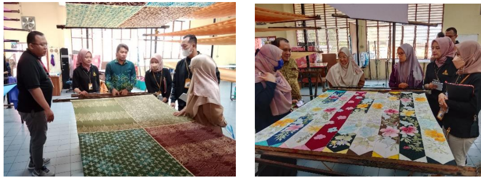
Fig 7. Monitoring the results of MSMEs production