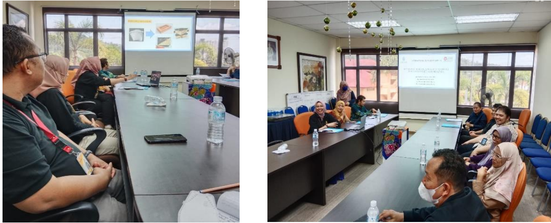
Fig 4. Counseling to partners

be developed by developing product designs, motifs and coloring on ceramic products. Batik motifs or other interesting contemporary motifs can be applied to the resulting ceramics so that they can appeal to consumers. In addition, product designs can be tailored to consumer needs, such as ceramic souvenirs for weddings and so on. Packaging innovations for ceramic products that are small to medium in size can be packaged in beautiful mica boxes or with packaging made from natural materials. On the packaging can be given a labeling sticker that shows information about Jessie art & Craft. Following are a number of documentations of the implementation of outreach activities to partners: