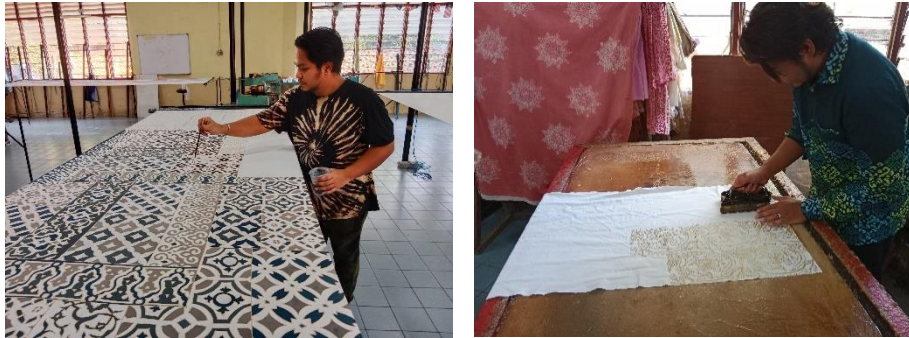
Fig 2. Production of written batik and block batik