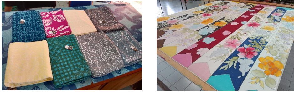
Fig 1. Batik products produced by SMEs