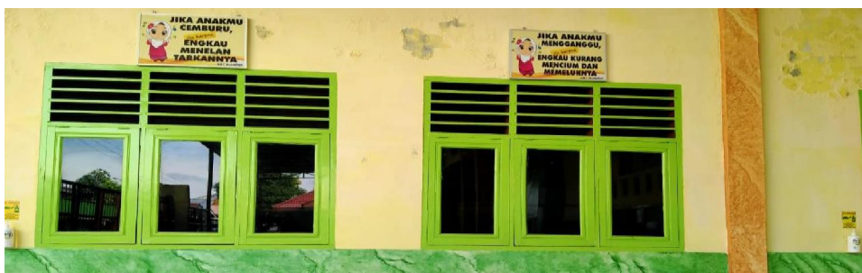
Fig 4. Placement of Hand Sanitizer near the entrance

Health protocol information provided in the form of posters and stickers. The installation of posters and stickers is expected to raise awareness and remember the importance of readiness for New Normal Education, prevention of covid transmission and alertness in the attitude of preventing transmission of covid 19. Installation of Hand Sanitizer at every entrance provides information and awareness of maintaining cleanliness.