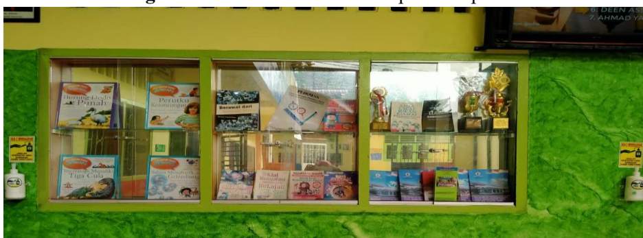
Fig 3. Position the Hand Sanitizer with the Wall Magazine.