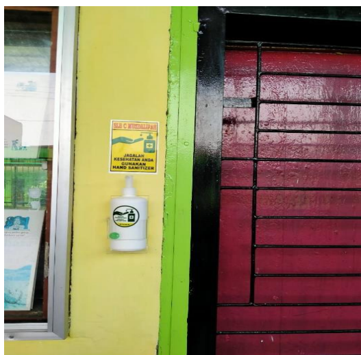
Fig 6. Hand Sanitizer Stickers