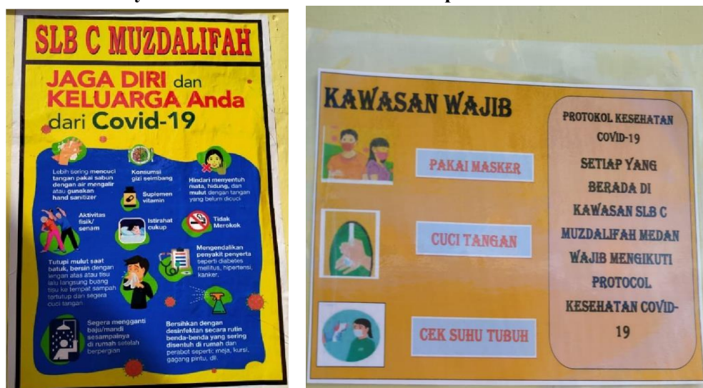
Fig 5. Health Protocol Poster