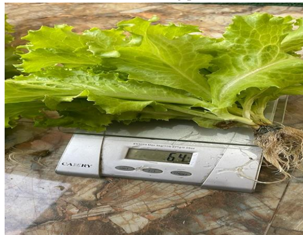
Fig 3. Results of Weighing in the Harvesting Process in Home Gardens