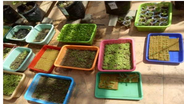
Fig 9. Finishing Stage of Installation Support Legs

Nursery of lettuce vegetable plants. The steps for nursery are as follows.