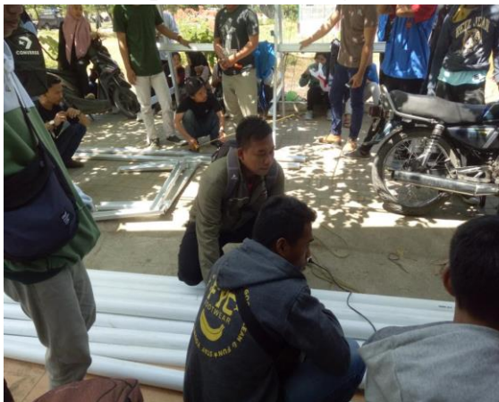
Fig 4. The Measurement Process of the Hydroponic Installation