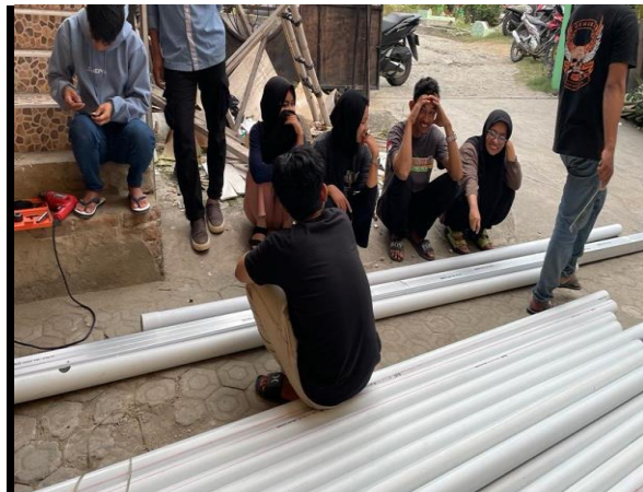
Fig 5. The Drilling Process of PVC Pipes for Lettuce Plants

In Figures 4 and 5 above, the assembly process of this hydroponic installation framework made of PVC pipes is depicted. The first step is to measure the length of the hydroponic installation framework according to the narrow space available in the house's backyard. The steps are as follows.