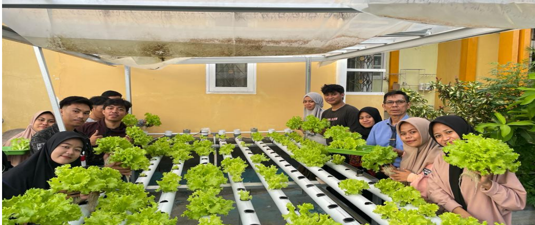
Fig 1. Effective and Efficient Utilization of Narrow Home Gardens by Tanamodindi Sub-District Residents

awareness and the capability to utilize their backyard gardens, while others have already used their yards by planting vegetables, fruits, and ornamental plants. The condition of residents' backyard gardens on Merpati Street, Tanamodindi Sub-District, which have utilized their narrow backyard gardens, can be seen in the following picture.