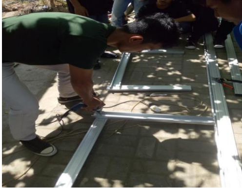
Fig 6. The Process of Making Installation Support Legs