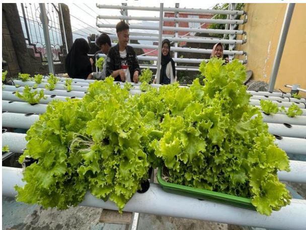
Fig 2. Harvesting Process in Narrow Home Gardens of Tanamodindi Village Residents