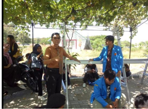
Fig 7. Finishing Stage of Installation Support Legs

Figures 6 and 7 show the students and the surrounding community's process of making table legs using lightweight steel taso rafters. This is because the taso rafters can last long, resist rust, and are easy to shape for making the table legs. The steps involved in the making are as follows: