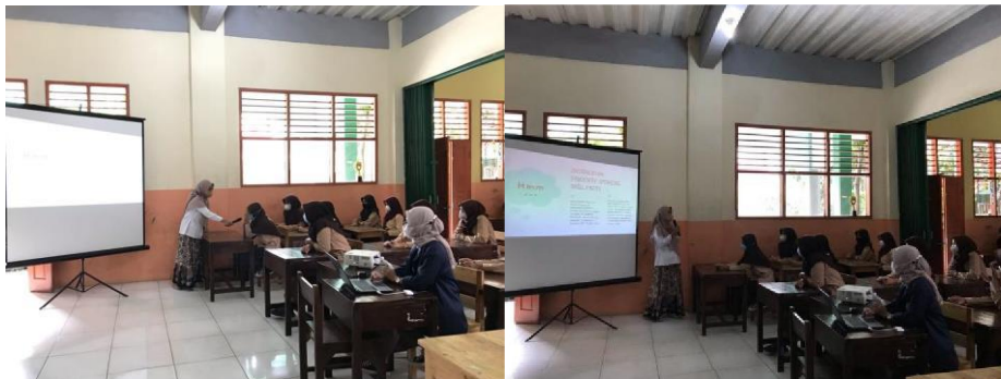
Fig 6. Facilitator Invited the Workshop Participant(s)

technological world. In addition, the facilitator who were also the presenter really invited the students to try speaking English while the presentation takes place. However, they still lack of vocabularies to say things in English correctly. Thus, this workshop also helps the facilitators know about the characteristics of the students at SMP Garuda who will be the members of English Club Extracurricular at the school.