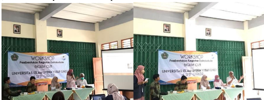
Fig 7. Facilitator Presented Essential Points on E-Club

In addition, the participants of the workshop especially the students were really enthusiastic to know more about English Club Extracurricular. Thus, other facilitator presented the various activities that can be done in the E-Club. Students also seemed interested in listening to the presentation. It is their first time to know such things at school, and it is really enrich their experiences.