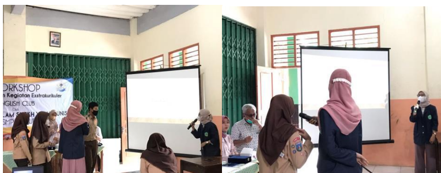
Fig 9. Students's Participation on Fun Games

Students of grade 8 and 9 were very enjoyed and enthusiastic when joining the games. They seemed confidence to come in front of the class to do the Words with Song Game, it is a group work game which each member of the group has to continue writing the words from the previous one, as much as they can until the played song stop. They were enjoying the beat of the song as well as thinking how to write more words on the whiteboard to win the game. While the Hot Seat game is kind of Eat-Bulaga Game which is one of the students in a group needs to sit on a chair to guess the picture behind him or her, then the rest of the members will give the clue to succeed the game. It was very interested and really fun games in this workshop.