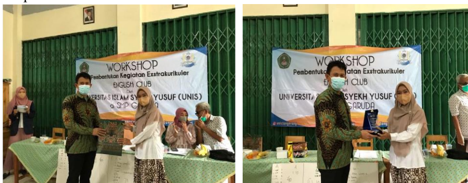
Fig 10. Handing over Souvenirs from each Party

English teacher and also other teachers of SMP Garuda who were interested to join the workshop.