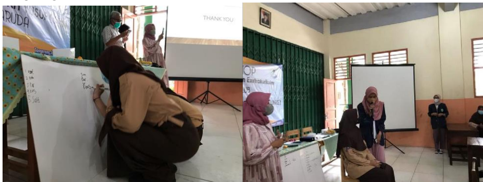
Fig 8. Students' Participation on Fun Games

On this workshop, students also introduced the variety of English Activities which are very fun to do in the Club, such as story telling, role play, English corner, English Debate, and other fun games. Additionally, the team of PkM from UNIS Tangerang especially the college students also facilitated the fun and educative games to be applied in the workshop. It is done for gathering the excitement of the students in learning English.