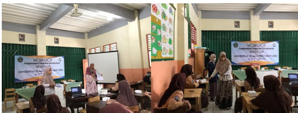
Fig 4. Questionnaire Distribution After The Workshop

After knowing the results of the pre-survey and questionnaires from the students regarding the importance of English Club Activity, the facilitator then proposed a proposal of the English Club Extracurricular formation to the the school principal to be discussed later in the FGDs along with the vice principles.