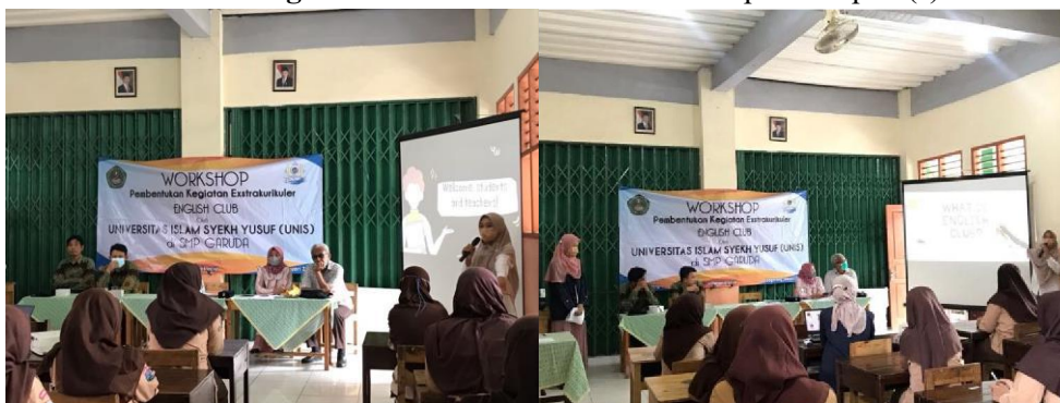
Fig 7. Facilitator Presented the Concept of English Club

In addition, the participants of the workshop especially the students were really enthusiastic to know more about English Club Extracurricular. Thus, other facilitator presented the various activities that can be done in the E-Club. Students also seemed interested in listening to the presentation. It is their first time to know such things at school, and it is really enrich their experiences.