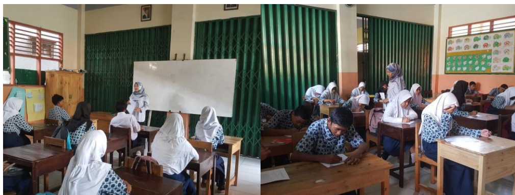
Fig 3. Questionnaire Distribution Before The Workshop