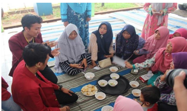
Fig 1. Students conduct demonstrations that are noticed by MSME members

The visual appeal of their products, which includes color, shape, illustrations, and, of course, branding, can influence consumers. Packaging functions as a means of wrapping a product, protecting, releasing, protecting, storing, identifying, and distinguishing it in the market [4]. Giving recommendations for packaging design designs and the Tahu Walik Udang brand, one of the leading MSME products in Segunung Hamlet, Carang Wulung Village, Wonosalam Regency, is one of the results of this community service activity. Even though MSMEs in Segunung Hamlet, Carang Wulung Village, Wonosalam Regency have succeeded in producing Shrimp Tofu in various flavors, they still appear conventional to capture the potential of the millennial market. Therefore, assistance is needed to make tofu walik prawns in more attractive packaging.