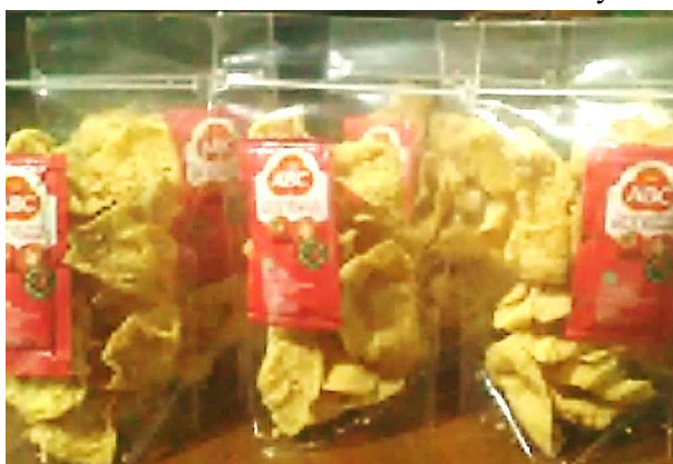
Fig 2. Tofu Walik Shrimp Packaging