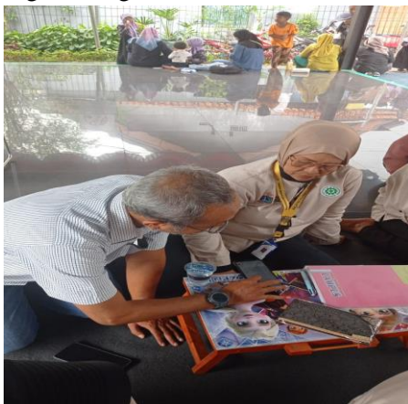
Fig 1. Mentorship

With this program, it is hoped that UMKM in Srengseng Sawah Village can be better prepared to face the challenges of digitalization and be able to compete in an increasingly competitive market.