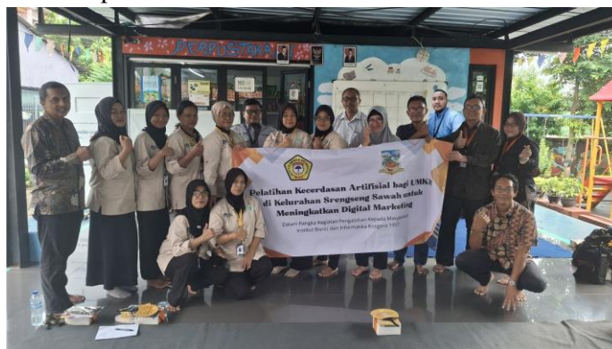
Fig 3. Documentation Photo Session

The team developed both printed and online training materials that encompass all training sessions, how-to guides, ethical storytelling tips, and real-life examples. This approach allows individuals to easily access and revisit the resources over time, aligning with educational goals that emphasize the importance of proper documentation for skill development.