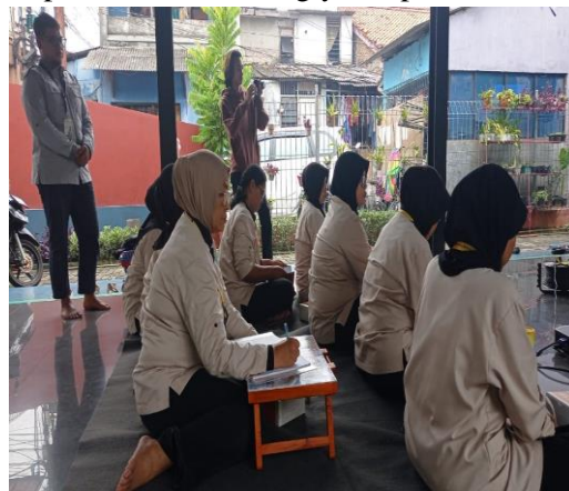
Fig 2. Participants look enthusiastic