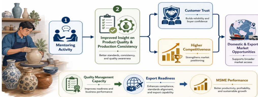
Fig 2. Impact of Mentoring on Ceramic MSME Quality and Competitiveness