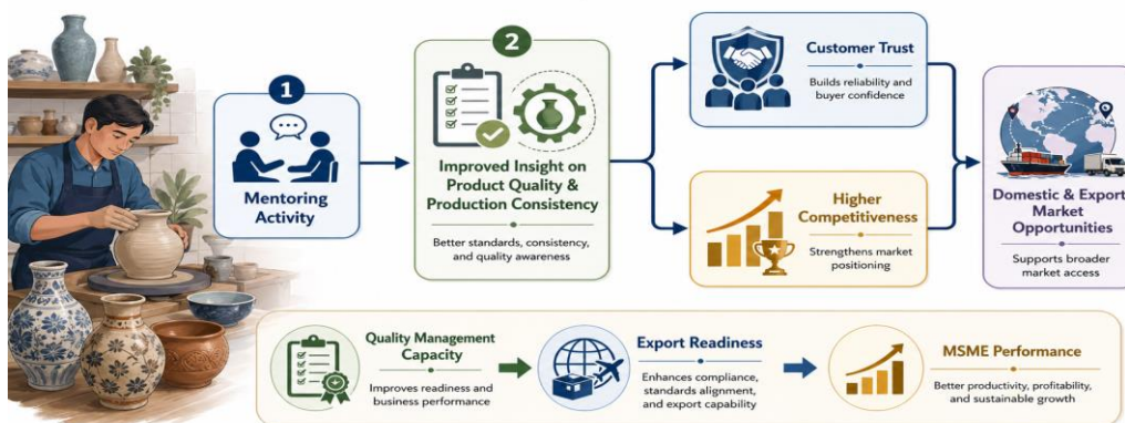
Fig 2. Impact of Mentoring on Ceramic MSME Quality and Competitiveness

Third, the craftsmen received practical input regarding product design development and the need to adjust products to target market preferences. Ceramic products for export markets need to consider not only